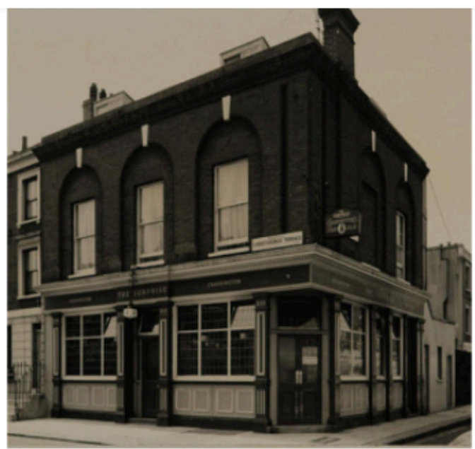
The Surprise in the early Twentieth Century. In 1940, it was partially destroyed by a bomb

A younger crowd recalls it fondly as one of the first proper places they drank after moving to London: the first pub away from the high street drinking holes, the graduate spots; a venue above the Clapham-Battersea-Fulham nexus that only the more seasoned pubman would know about. When I posted on Instagram asking for memories of the place, I got a deluge of responses, many prefaced by a ‘please don’t print this, but...’ warning. A couple of trends, though, emerged from the throng; that this has always been a place for very long afternoons with close friends; and that it is a particularly convincing spot for dates — relaxed but never shabby; just the right amount of effort. (And just a short trot down to Cheyne Walk/ Albert Bridge afterwards, should you want something romantic and twinkly.) One friend tells me it was always catnip to Americans: “it feels like a tiny, old, hidden village pub, in the middle of London.” The position and aspect is also rated highly: there is something solid, permanent, baked-in about a pub set into a terraced corner. It feels as if the pub sprung up first, and the houses came next. And it means the Surprise is filled with a lovely light. But most of the feedback is intangible and wistful. “it is my favourite pub because it has always been my favourite pub”, says one friend, which sort of sums it up. In short: no pressure.